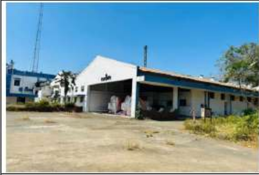
GI SHEET PROCESSING AREA VIEW