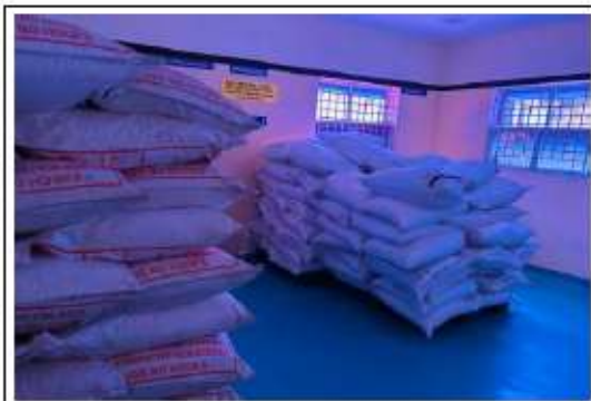
RAW MATERIAL STORAGE AREA VIEW