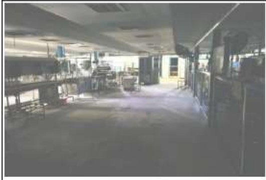
PROCESSING UNIT VIEW