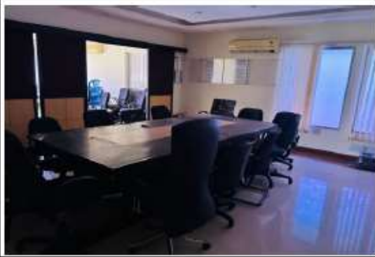
CONFERENCE HALL VIEW