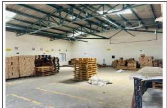
STORAGE AREA VIEW