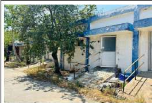
LABOURS SHED AREA VIEW