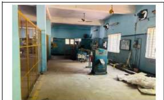
WORKSHOP AREA VIEW