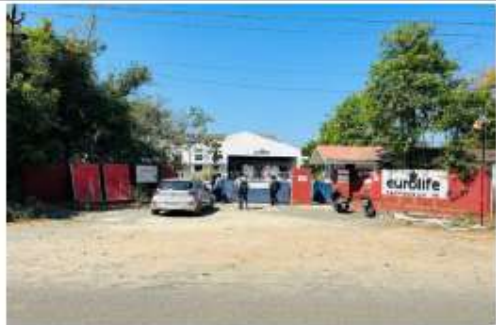
FRONT ELEVATION VIEW