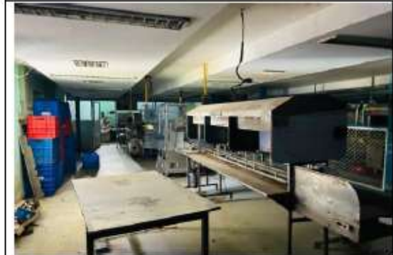
PROCESSING UNIT VIEW 2