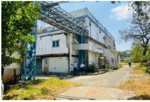
MAIN BUILDING VIEW