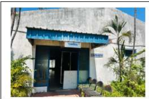
CANTEEN BUILDING EXTERNAL VIEW