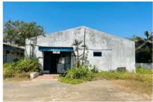
TRUSS ROOF BUILDING EXTERNAL VIEW