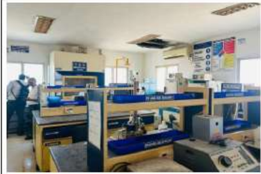
TESTING CUM LABORATORY AREA VIEW