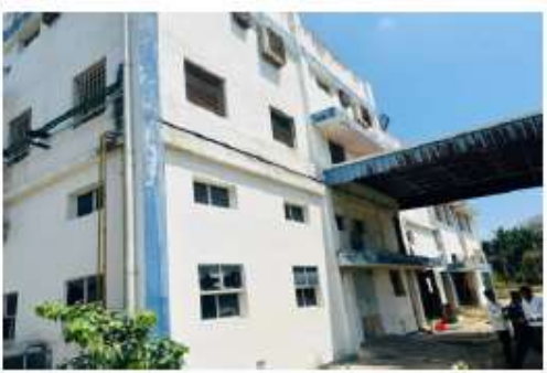
MAIN BUILDING ENTRANCE VIEW