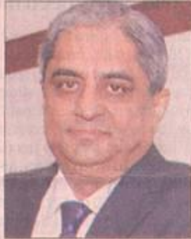
ADITYA PURI, HDFC Bank MD

Steve Jobs would surely have stayed on the list, if he were still alive. Jobs made the original list and remained there each year until his death in 2011. Jobs' successor Tim Cook has joined the group this year.